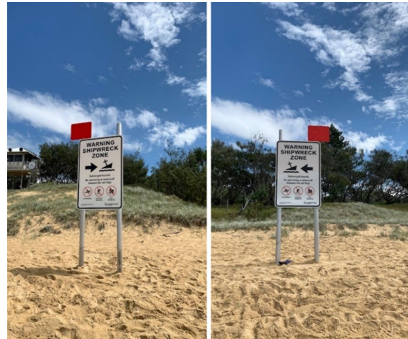
Signage and red flags indicating beach closure following installation on 23 rd March 2023