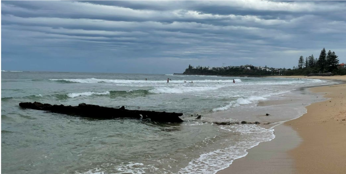
Survey photograph – 9 March 2023