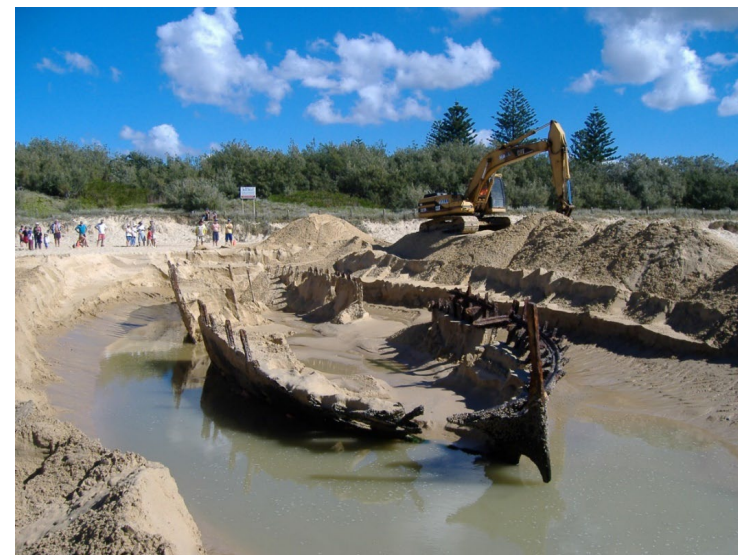
S.S. Dicky exposed hull – July 2006 and 2015.