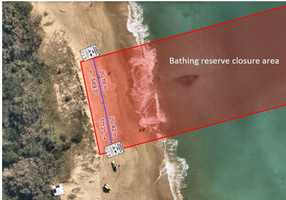
Map of current temporary beach closure area (seeking council endorsement for six-month closure)